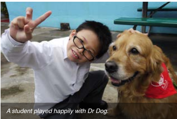
A student played happily with Dr Dog.

We visited seven students, aged between seven and nine, (six autistic children and one child with Downs Syndrome) from the Hong Chi Winifred Mary Cheung Morninghope School — a school that takes care of children with mild to moderate mental challenges. These children were selected to be enrolled in our “Dr Dog VIP programme”.