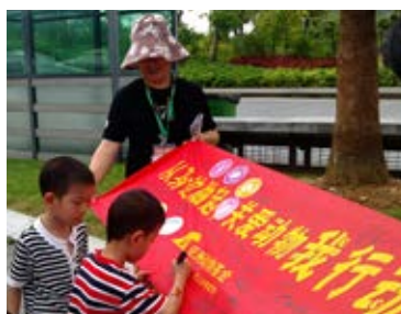
Twins draw a dog on the promotion banner to support us.

The 2013 Midi Music Festival took place from 17th to 19th of May in Shenzhen. We attended the festival and combined music with the theme of “Care for animals” and “Responsible dog ownership” together with “Don't eat friends” — an animal protection group. Our activities were supported by many music lovers.