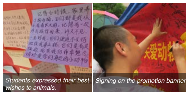
Students expressed their best wishes to animals.

http://cc.hnu.cn/index.php?option=com_content&task=view&id=2242