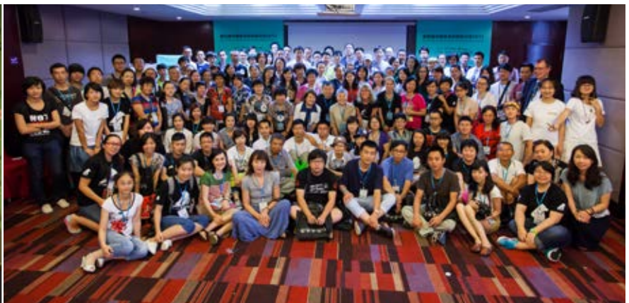
Group photo for the 4th China Companion Animal Symposium.

Animal welfare organisations across China have agreed to work together against the “criminal and cruel” dog and cat meat industry.